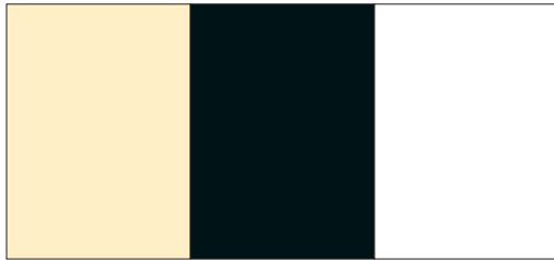
4X2-230 Clear/ Ivory

Sleek and glossy, this reverse-engravable line will liven up any sign system. UV stable, outdoor weatherable and ideal for back-painting, back-lighting and three dimensional engraving effects.